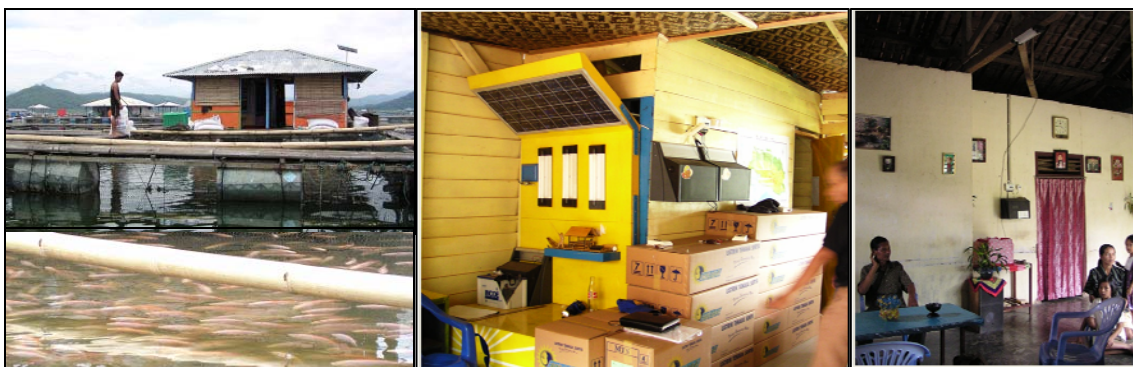
Fig.4: The WB/GEF SHS project. 1&2) Cirata Lake, West Java: A 50 Wp SHS installed on a hut roof of fish floating net powering lighting and telecommunication to support economic activities, and an outlet displaying SHS. 3) Lampung Province: The battery and the BCR are located in the living room allowing practical observation of charge state and acid level of the battery by family members.

In general users acknowledged SHS benefits (more practical, more reliable compared to the grid, improved quality of life, less use of kerosene and diesel fuel, creating jobs during project implementation) but there were also cases where SHS remained alien (lamps too bright to sleep at night, fear that brighter light provoked observation by thieves). The banking system remained unpopular (villagers preferred to keep their money under the pillow rather than depositing it in a bank, villagers preferred to spend their time working in the field rather than travelling to a bank office located a distance away from the village, the credit administration process involving a letter of recommendation from the head of the village was seen as disclosing a financial hardship to others ((Dian Desa 2003 in Retnanestri 2007)). Resolving this required an innovation in a non-technical dimension during project design and implementation for the local people to acculturate SHS in their lives.