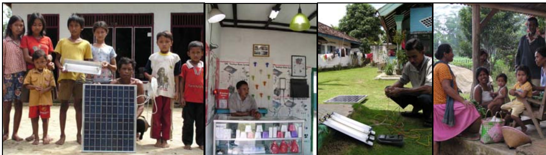
Fig.3: The SHS organic market in Lampung Province, Sumatra. From left: 1) A farmer who had owned SHS since 1991 purchased a second SHS package. 2&3) The SHS technician displaying spare parts in his outlet and demonstrating a simple SHS current-voltage (I-V) testing. 4) An SHS user discussing SHS with neighbours.

SHS has been part of the ongoing activities of the local people who have demonstrated a high degree of technical reinvention (BCR bypass, system configuration) and social innovation (job creation, SHS is used beyond lighting purposes for swallow bird farming, users wanted PV-powered radio for working at field, donation to community facilities, strategy for reducing fire risk hazard from kerosene wick lamps, etc) indicating SHS acculturation into local life.