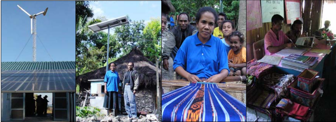
Fig.5: From left: 1) The PV-Wind-Diesel hybrid system (21.8kW-10kW-20kVA) installed in Oeledo village, Rote Island/NTT. 2&3) PLD Pusu: A SHS subscriber whose also a weaver of West Timorese traditional fabric now able to work for longer hours and earn more. 4) Monthly SHS payment session at PLD Pusu office, in which the traditional weaving products were displayed for sales.

The Pengelola Listrik Desa (PLD), or village electricity management formed from among the users, was initiated by the 1997-2000 E7 project as a CDM test-wise tool, facilitated by the locally based Womintra NGO (E7 in Retnanestri 2007). A PV-Wind-Diesel hybrid system was installed in Oeledo village, Rote Island. The PLD concept was later replicated in other parts of NTT, including Pusu village, in which 150 SHS units were installed during 2003-2005 (Retnanestri 2007).