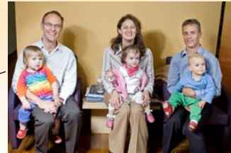
CEEM Intergenerational equity reference committee